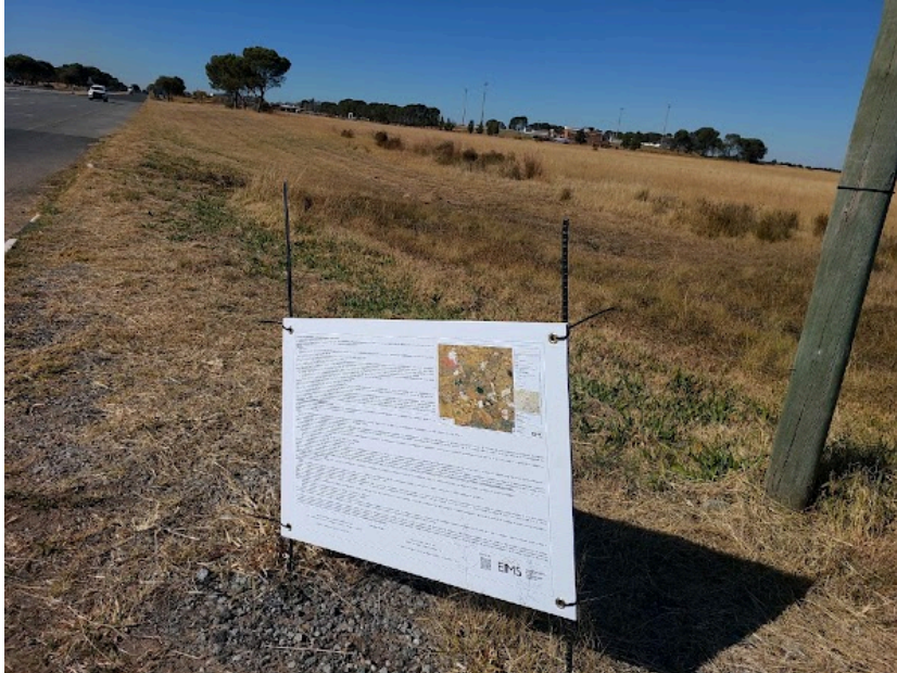
Site notice 3a

A1 Notice: 25/06/2024 14:37:49; GPS Coordinates: -27.973225, 26.688295