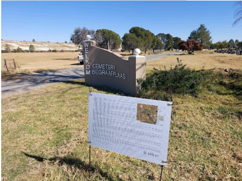
Site notice 4a

A1 Notice: 25/06/2024 14:40:50; GPS Coordinates: -27.957972, 26.690385