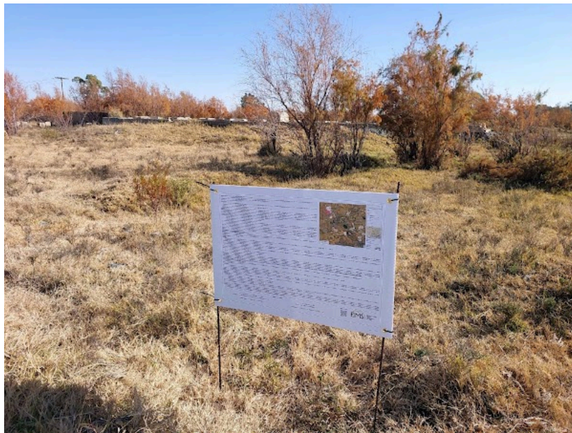
Site notice 10a

Poster: 18/06/2025 13:36:51; GPS Coordinates: -27.978685, 26.737501