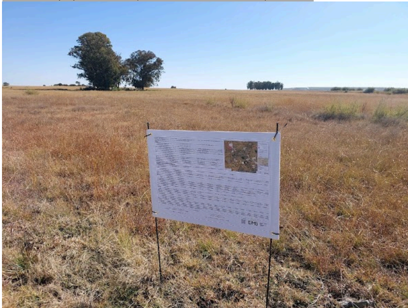
Site notice 7a

A1 Notice: 25/06/2024 15:03:29; GPS Coordinates: -27.948032, 26.675007