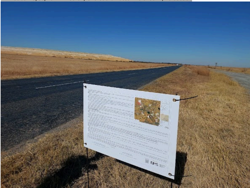
Site notice 2a

A1 Notice: 25/06/2024 14:35:07; GPS Coordinates: -28.013512, 26.686907