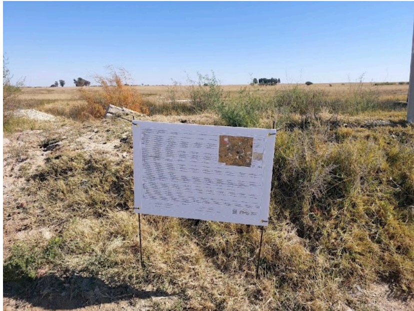
Site notice 6a

A1 Notice: 25/06/2024 14:50:05; GPS Coordinates: -27.935478, 26.693392