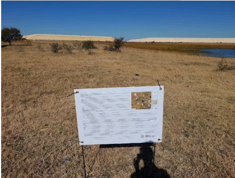
Site notice 9a

A1 Notice: 25/06/2024 14:58:33; GPS Coordinates: -27.899311, 26.664803