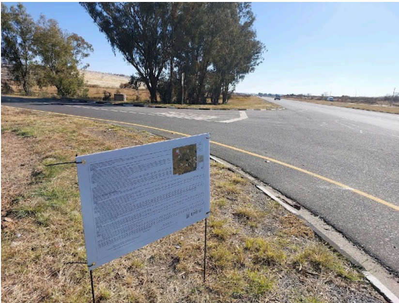
Site notice 1A

A1 Notice: 25/06/2024 14:35:07; GPS Coordinates: -28.013512, 26.686907