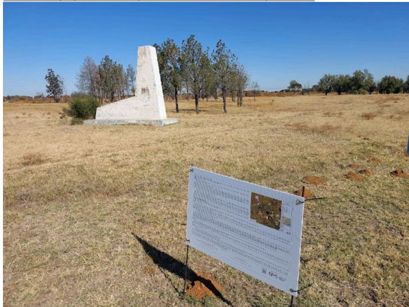
Site notice 5a

A1 Notice: 25/06/2024 14:50:05; GPS Coordinates: -27.935478, 26.693392